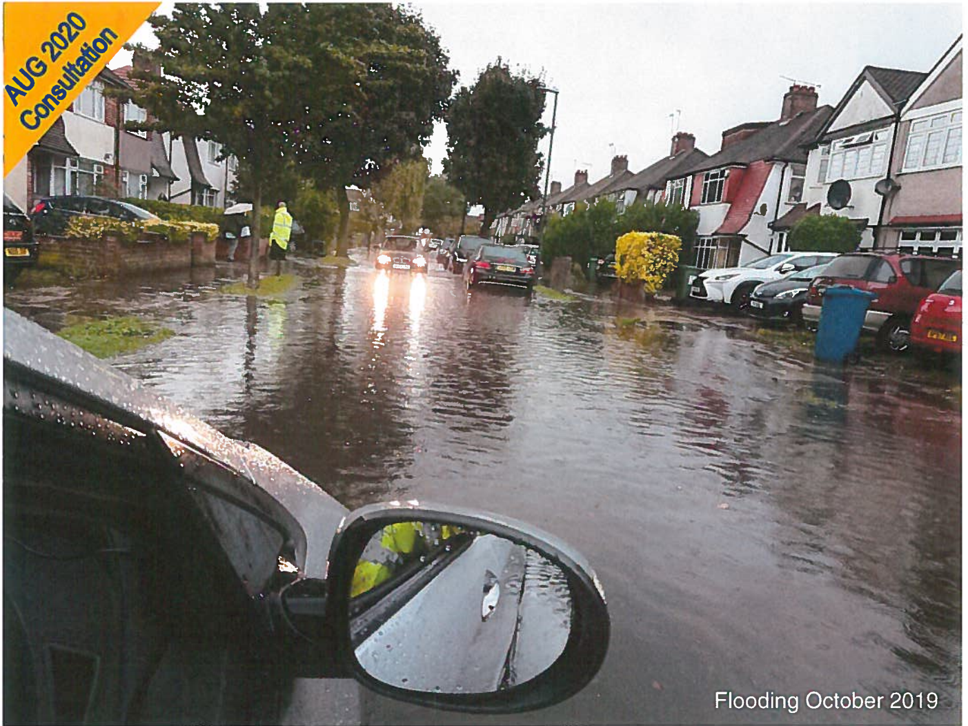
Flooding October 2019