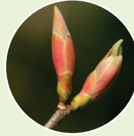
Sycamore buds