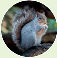
Grey squirrel