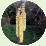
Hazel catkins