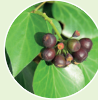
Common ivy