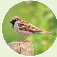
House Sparrow