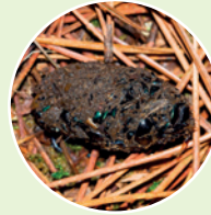
Fox poo