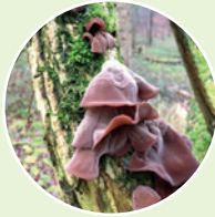
Jelly ear fungi