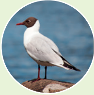
Black headed gull