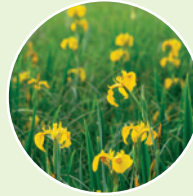
Flag Iris